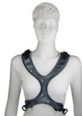
Vinyl Slim Fit