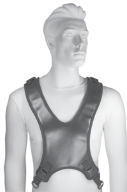
Vinyl Regular Fit