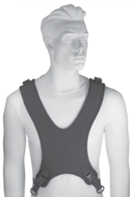
Neoprene Regular Fit