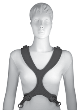
Neoprene Slim Fit