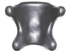
Full Headrest Pad 25-HP640