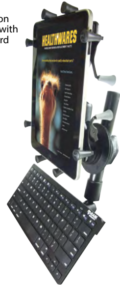
10" Tablet holder on Roto View Mount with Bluetooth Keyboard