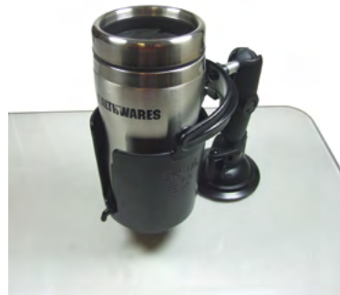
Swivel Cup holder with extension arm and Suction Cup Base