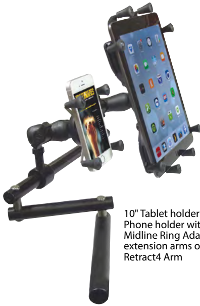
10" Tablet holder and Smart Phone holder with Retractable Midline Ring Adapters and extension arms on the Retractable Arm

Easily mount tablets, phones, cup holders and more right where they are needed with this new line of accessory mounts. Accessory Mounts allow for rotation and angle adjustment to precisely position devices. Wide range of mounting solutions—suction cups for mounting to trays and work surfaces, mount for Retractable swing-away arm, variety of bases for attaching to different chairs and surfaces. Easy to customize and create a unique set-up with a variety of device holders, extension arms and adapters.