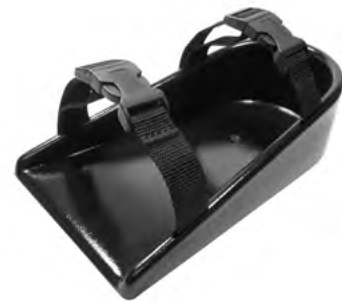
One Piece Shoe Holder shown with Side Release Straps