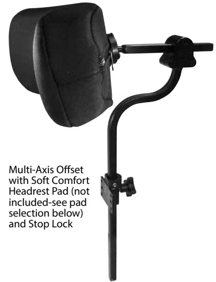
Multi-Axis Offset with Soft Comfort Headrest Pad (not included-see pad selection below) and Stop Lock